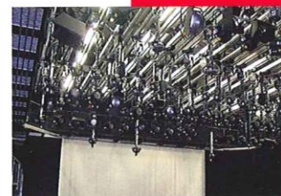
Rail systems – Studio and stage engineering