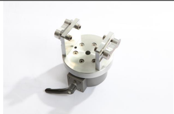
2207-50 Euromountadapter/ Schienenverbinder