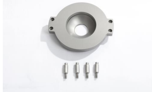
2032-1Set Bowl insert 100mm