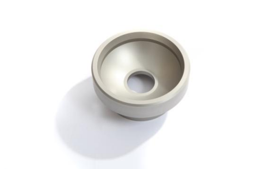
8328-0 Bowl adapter 100mm