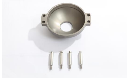
2031-3Set Bowl insert 150mm