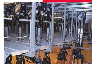
Pantographs – Hoists – Telescopes – Trolleys