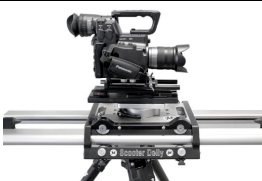
2207-90 Camera base plate/ Euromount