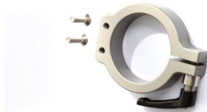
8530-2 Light bazooka clamp ring