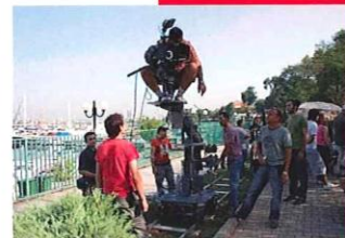
Dollies – Cranes – Remote Heads