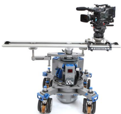
2207-50 Euromount adapter/ track connector