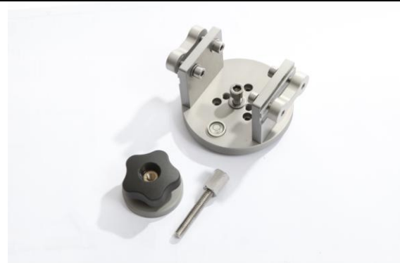
2207-30Set Ground plate track connector