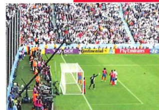
Steadycam systems – Light dollies – Light cranes