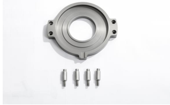
2041-10Set Mitchell base plate