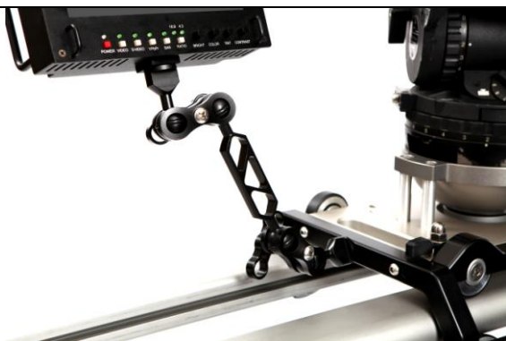
Monitor holder set 3/8" – 1/4" adapter, ball joints