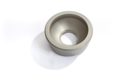
8327-0 Bowl adapter 75mm